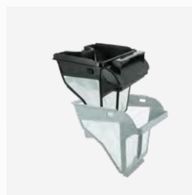
Filter canister Dual stage filter: 150/60 μ