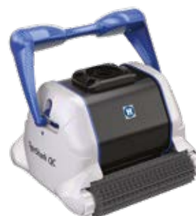
Tigershark® QC conical rubber brush