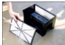
Filter panels that are easy to remove, clean and replace: (Included, RCX70101PAK2)