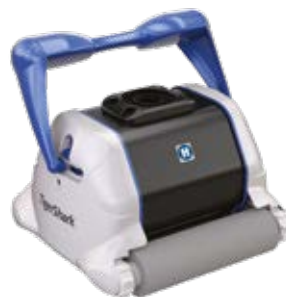
TigerShark® foam version