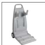
Optional ergonomic trolley RC99385 allowing you to move and store the cleaner quickly and easily